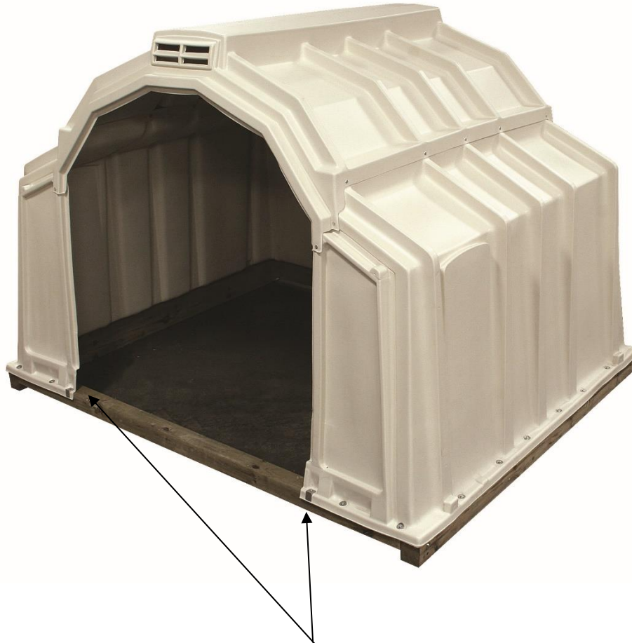
Entrance Bracket Locations